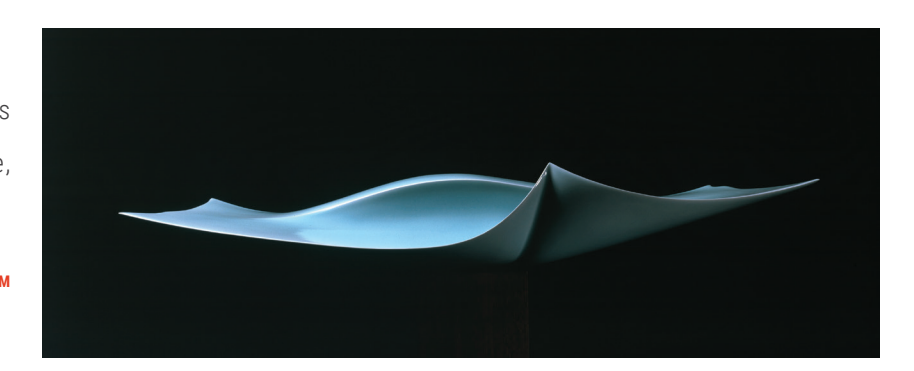
Sora ni (In the Sky), Sueharu Fukami.

Untitled photograph, Ice Cycles Series by Jean Vollum